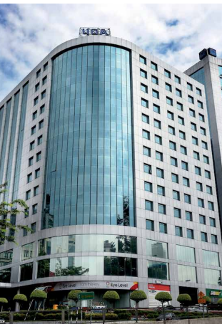
Malaysia (+60)3 2011 6165