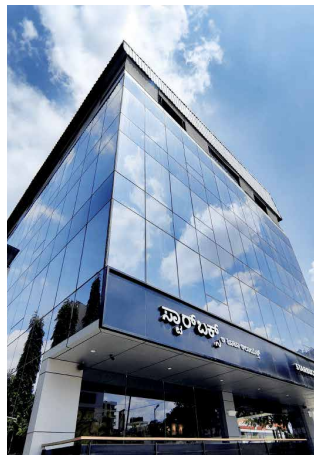
India (+91) 99161 33690