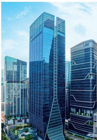
Singapore (+65) 6602 8101